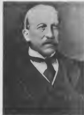
Lord Alfred Milner in 1914, the representative of the "race patriots."