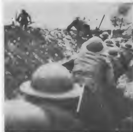
British troops in the trenches. British casualties were higher than even the realists expected.