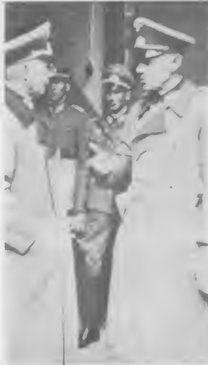
General Beck (r) and General von Fritsch