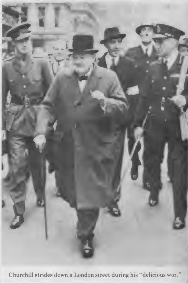
Churchill strides down a London street during his "delicious war."