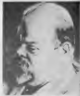
Alexander Helphand, a.k.a. Parvus