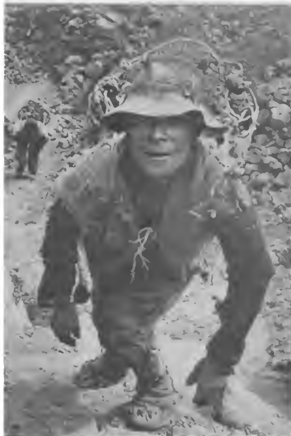
The future of humanity under the New Dark Ages: a Peruvian peasant numbed and euphoric from the coca leaves he is chewing carries rocks up a mountain.