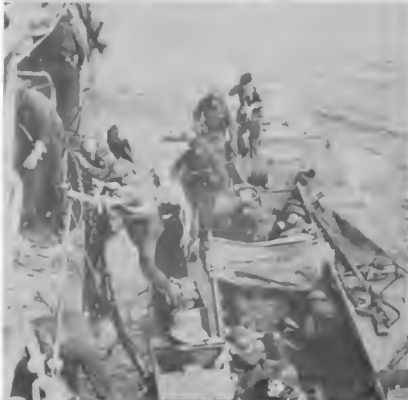
Survivors of Dieppe, Mountbatten's Combined Operations' designed disaster to "prove" the inability of the Allies to launch a second front in 1942.