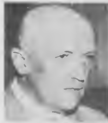
General von Schleicher

Plotters against Hitler whose requests for support were denied by the British: