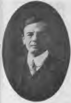
Coefficient Leo Amery