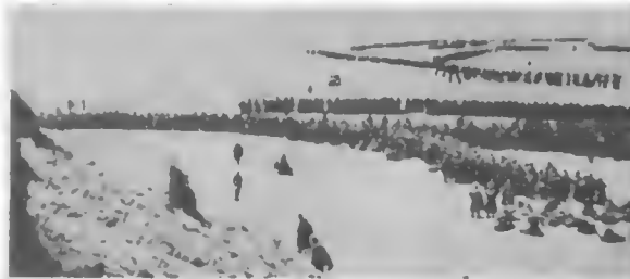
British troops awaiting evacuation at Dunkirk, an escape permitted the British on orders from Hitler.