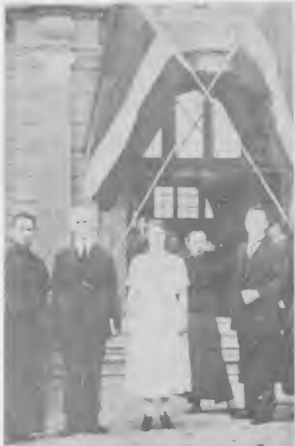
The first to play the China card: Bertrand Russell in 1923 at the National University of Peking, where he gave classes to Mao Tse-tung and Chou En-lai.