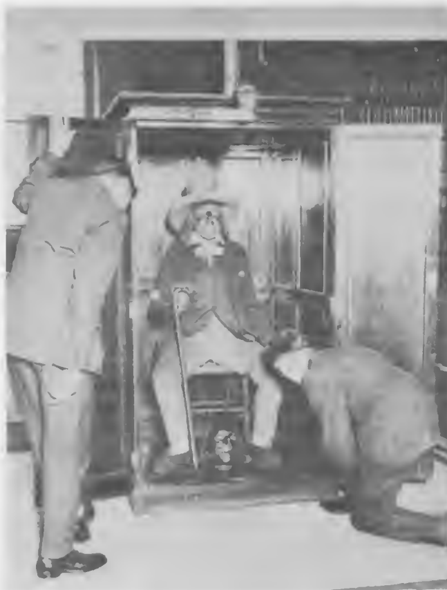
Jeremy Bentham in residence at the University of London. The head on the stuffed body is made of wax. Bentham's actual mummified head is below.