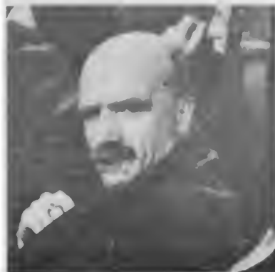
J. B. S. Haldane British host to Albert Einstein.