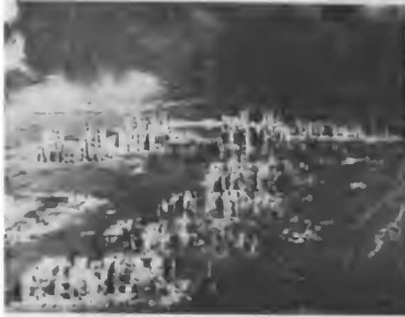
Stalingrad after the battle.