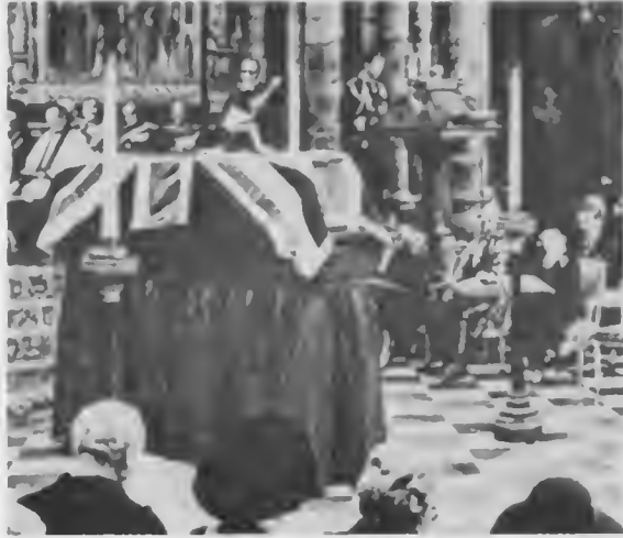
Mountbatten's murdered body lies in state in 1979—several months after he had exposed the concept of limited nuclear war as a strategic fallacy.