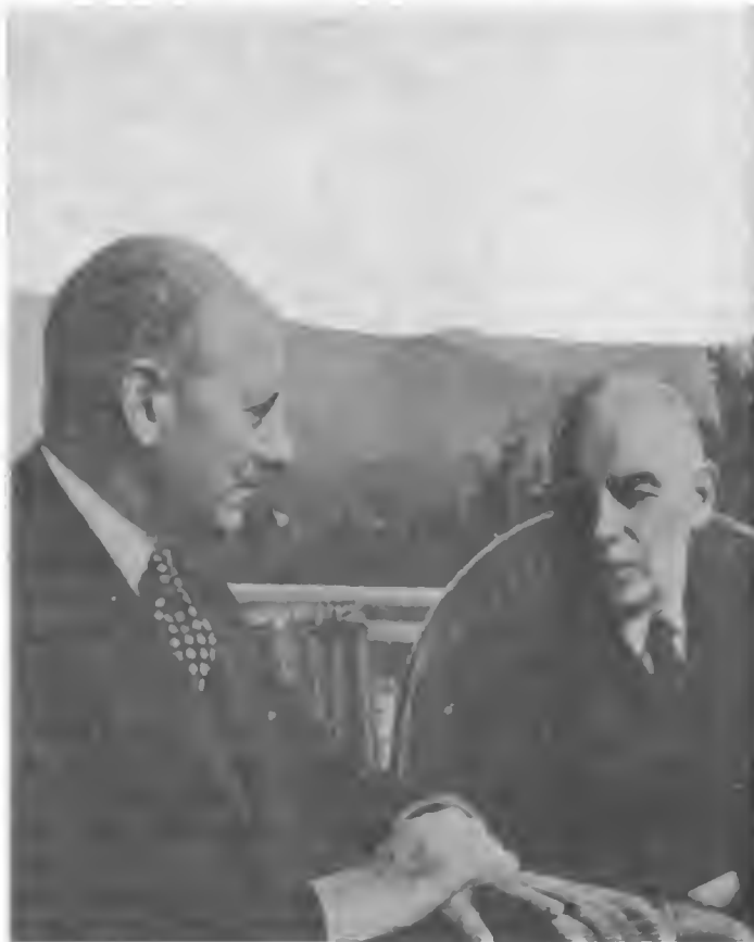
John Maynard Keynes (r), the architect of Versailles, with Henry Morgenthau, Treasury Secretary under FDR, whose name is attached to Churchill's plan to turn Germany into a nation "pastoral" in character.