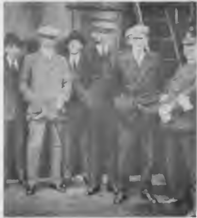
The Dawes Commission en route to Germany, where it ordered the dismantling of the country's railroad system. Rufus Dawes is second from the right.