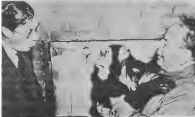
Julian Huxley (l) at the Cleveland Zoo