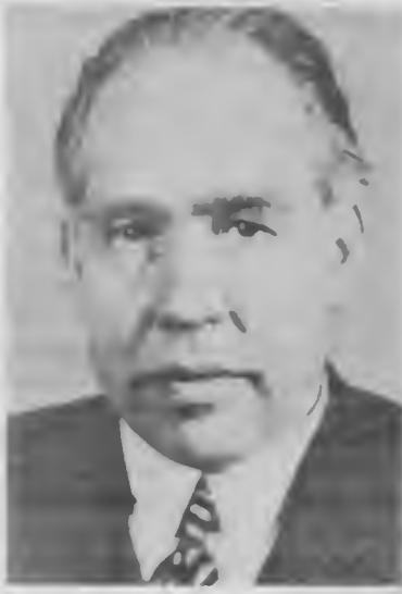
Niels Bohr, the Russell protégé who worked to destroy the potential of physicists