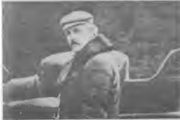
Lord Arthur Balfour in the 1920s