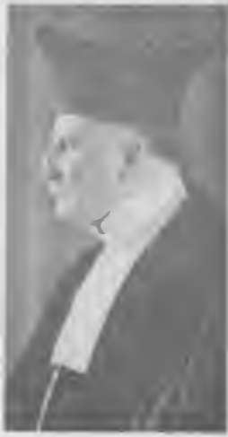
Karl Haushofer, the ghost writer of Mein Kampf , who also wrote a complimentary introduction to the German edition of Russell's Problems of China .