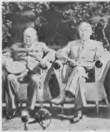
Churchill and Truman at Potsdam, where the American President refused to discuss plans for a new war against the Soviet Union.