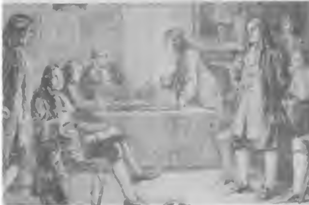
The founding of the British Royal Society, which was modeled on Bacon's New Atlantis