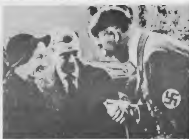
The former King Edward VIII shakes hands with Hitler in 1937.

Neville Chamberlain signs the Munich Pact, the British seal of approval for the crushing of the "Czechoslovak sausage."