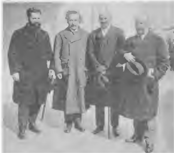
Einstein with British-sponsored Zionist Chaim Weizman (l).