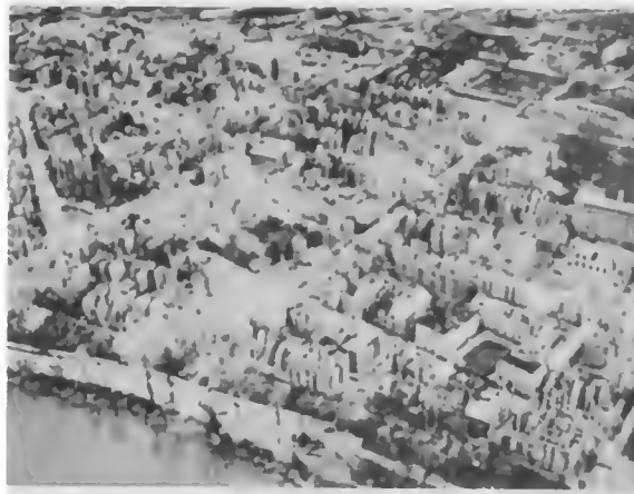
The ruins of what was once Mannheim, Germany.