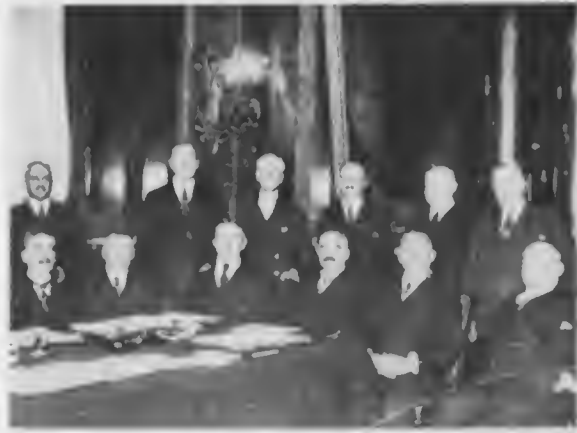
The first meeting of the Reichsbank with Hjalmar Schacht sitting, third from left.