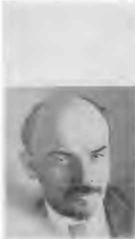
Vladimir Lenin, who upset the Coefficients' plan for World War I.