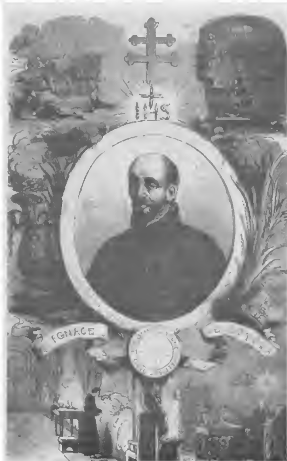
Ignatius Loyola, founder of the paramilitary secret-intelligence organization, the Society of Jesus